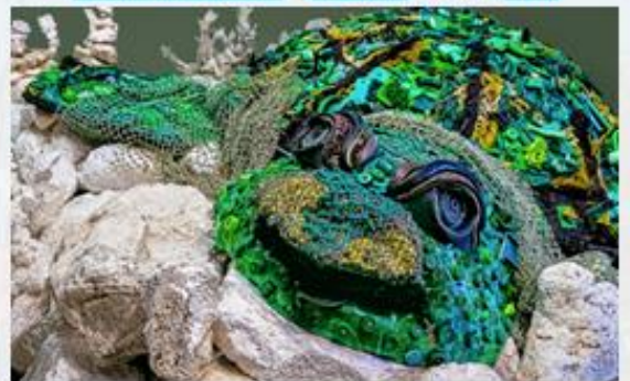
"Whale made from Recycled Plastic" by [Name Redacted] is licensed under CC BY 2.0